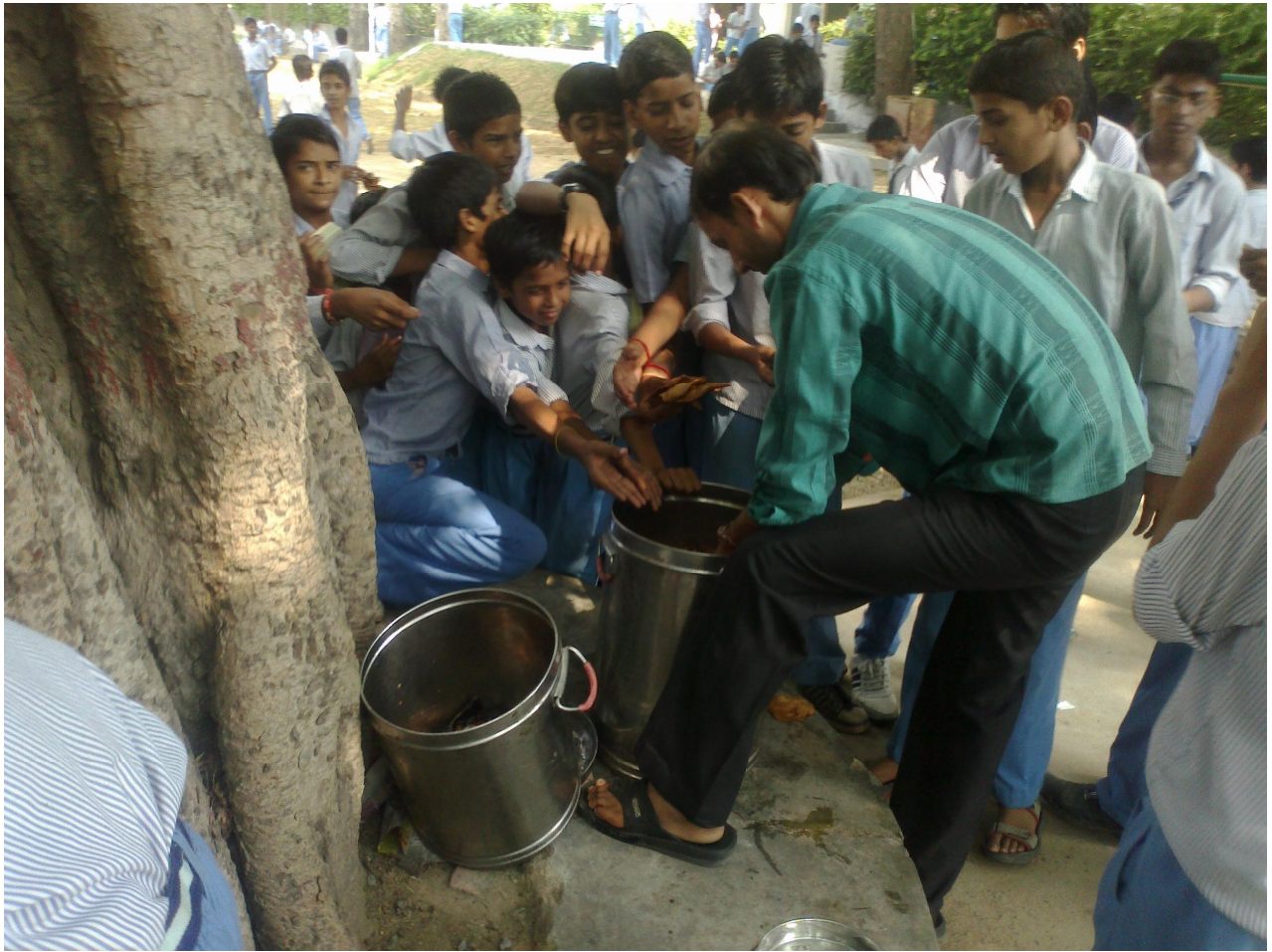
DAV Sr. Sec. School West Patel Nagar, New Delhi