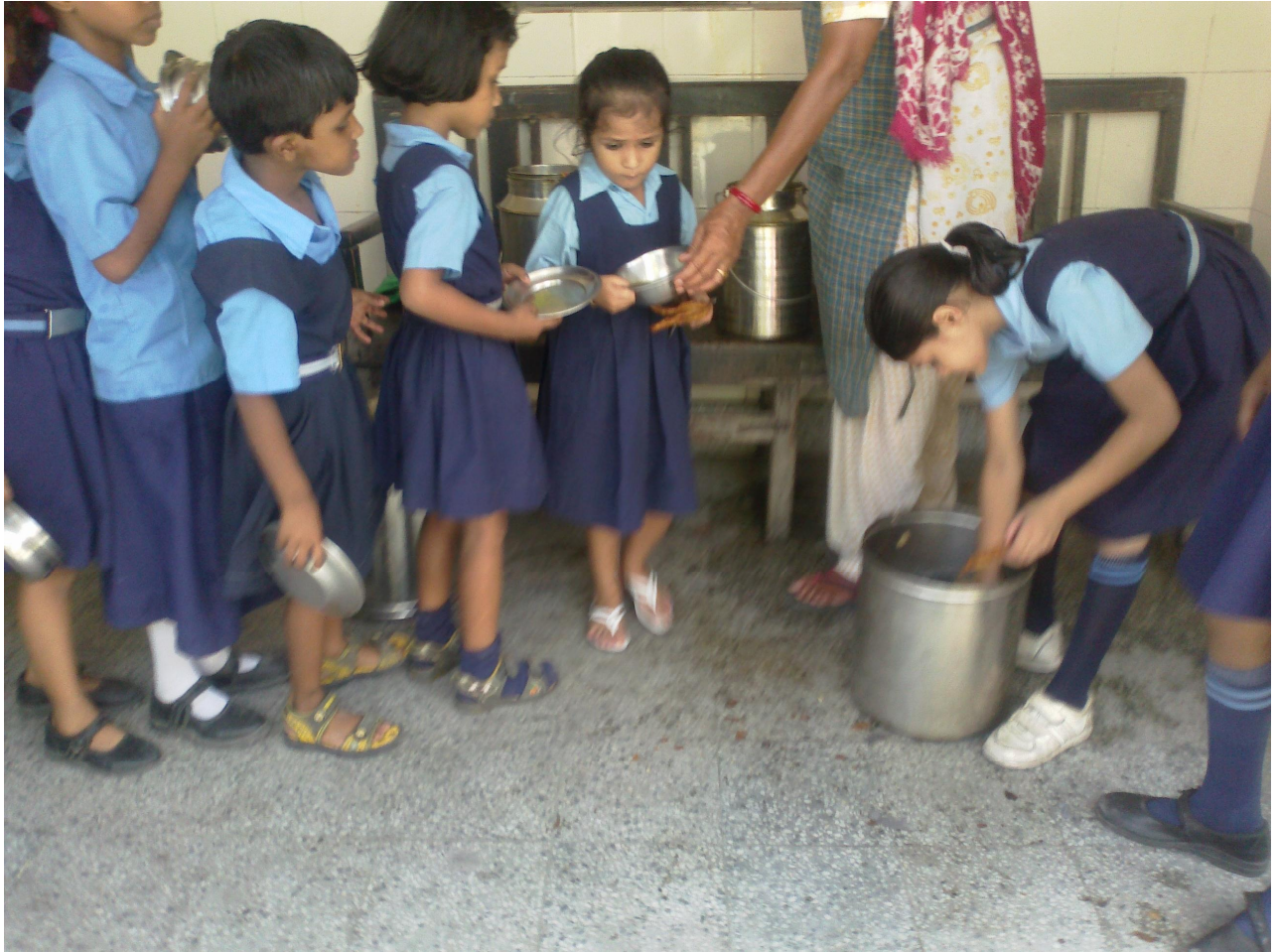
MC Girls Primary School Mahavir Nagar, New Delhi