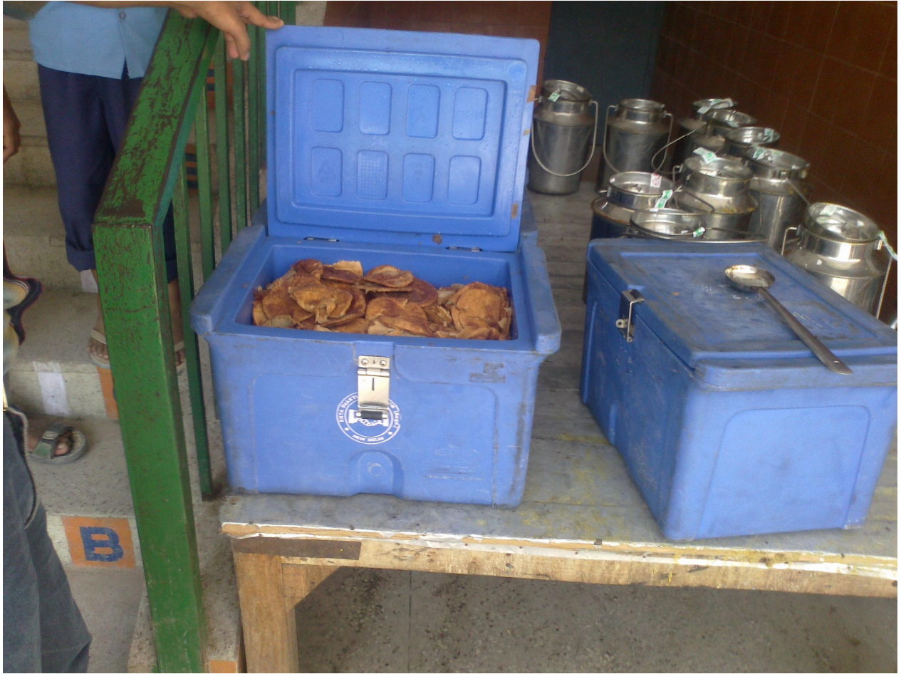
MC Boys Primary School Mahavir Enclave, Part 2/3, New Delhi